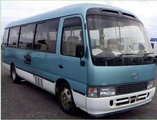
We are praying for God's provision to buy a new school bus

Coming together is a beginning, staying together is progress, and working together is success. ~ Henry Ford