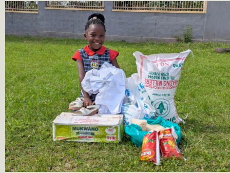
Redempter with the items from her gift